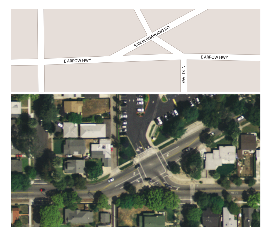
Figure 1: Map (Informing Design, Inc.) and aerial photo of mismatched Y-intersection

Another notable example of a naming problem occurred when the traveler was asked to turn on the second occurrence of passing a horseshoe shaped road on the right. In another case, the traveler was advised to turn the third time a particular road crossed the main road. In each case, responding simply to the name of the road would lead to a turning error.